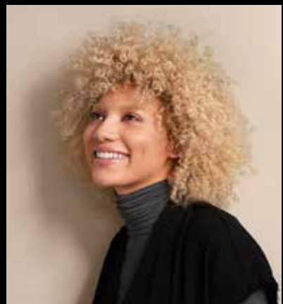
CHAMPAGNE BLONDE Artist: Donna Mizell • Created a rosy, beige blonde by smudging 8NB (8/07) and 10NB (10/07)