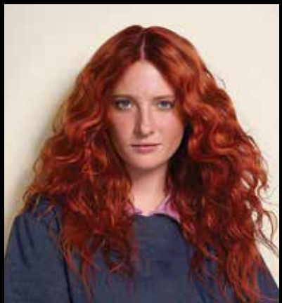
FIERY COPPER Artist: Jenn Montoya • Created a reflective red using Color XG™ Copper Series for maximum vibrancy