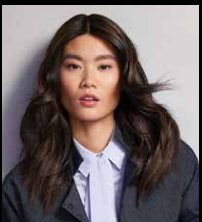
COLD BREW Artist: Hope Schiller • Achieved a smoky, cool brown by highlighting with Dual-Purpose Lightener next to H/LPA (12/81), then adding depth and dimension using 4PA (4/81), 6PA (6/81) and 8PA (8/81)