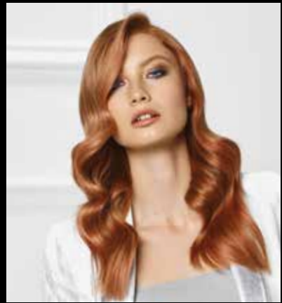
PEACH PEARL Artist: Colin Caruso • Achieved using a peachy-peach Color XG™ 9PN (9/80) + 8C (8/34) + Clear Booster formula on the base, then shade-matched Crema XG™ alternating formulas in PA (81), RO (43), V (6) families and Clear on the mid-lengths and ends

For the complete model formulas and techniques, please visit paulmitchellpro.com or pmcolorhq.com .