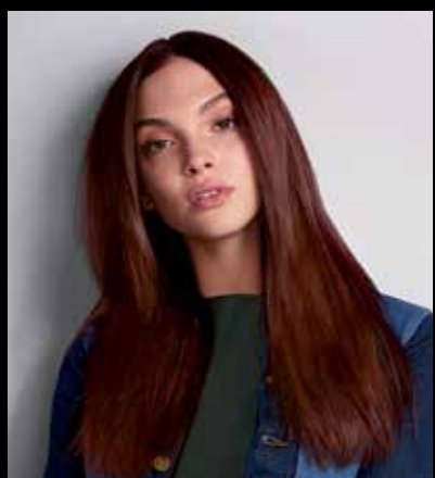
MELTED MAUVE Artist: Anya Segers • Alternated 7RV (7/46), 5VR (5/64) and 7V (7/6) in eight simple sections