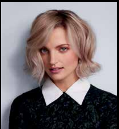
DIMENSIONAL PEARL Artist: Colin Caruso • Achieved a sun-kissed cool blonde using Skaylight™ and Color XG™ Pearl Ash, Pearl Natural and Ash series